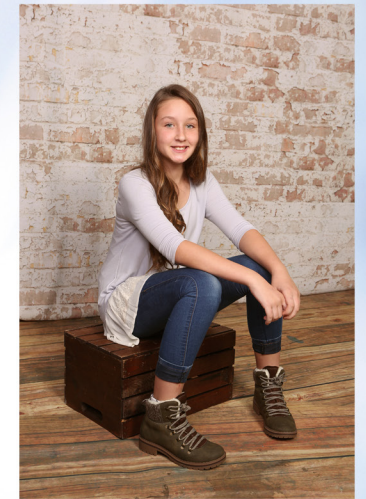
Background #3 'White Brick'