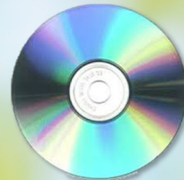
1-Image CD (H) high-res & printable