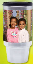
16oz Steel Drink Tumbler (L)