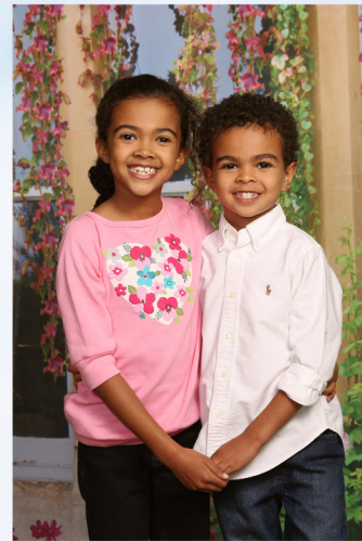
Background #1 'Garden' * Default Background