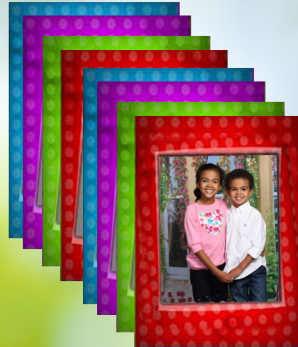
8-Wallet Magnets (U)