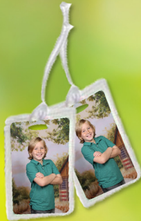
Luggage Tags (K)