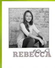
8x10 B&W Gallery Mat Image (J) name & year