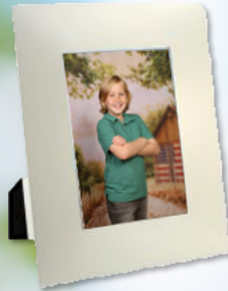
5x7 Metal Frame w/ Image (W)