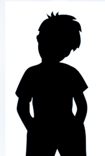
3/4 * Default Pose