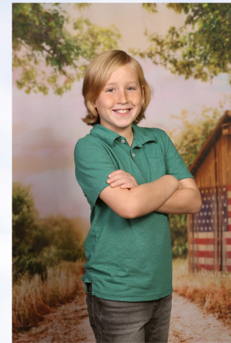
Background #2 'Country Road'